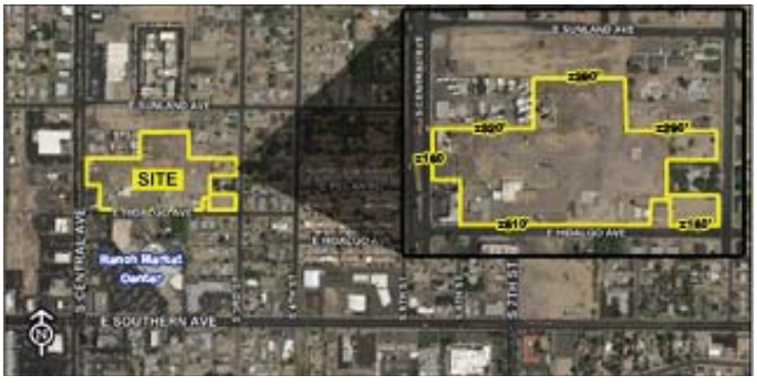
12 E Hidalgo

Tenant Rep Size: 93,489 SF Leased: April 2014